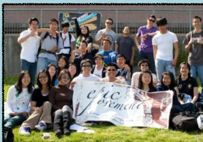
AT CCSF (SF, OCEAN CAMPUS): Half of our student group at City College. They were able to surface one potential ministry student leader, four students with strong campus connections and lead one girl to Christ!

downtown Union Square as well as nearby City College of San Francisco. As one student noted, "I am very thankful I got to be a part of starting a movement on campus... I believe it is a very rare opportunity." By faith our students are learning to be prayer warriors and bold witnesses wherever they go!