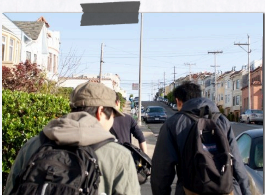
prayerwalking through SF as they go! -- thanks, raymond gao.

I'll be in touch! Feel free to also! - steph.